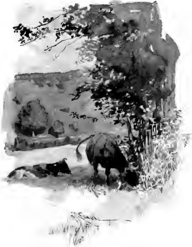
"THE CATTLE ON THE MOUNTAIN'S BREAST ENJOY THE GRATEFUL SHADOW LONG."—Page 113.